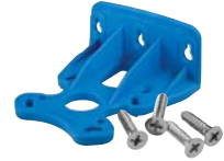
-S- wall bracket CODE RB7400007