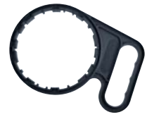
-U- spanner CODE RB7403013