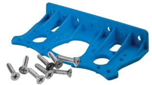
-D- wall bracket CODE RB7400009