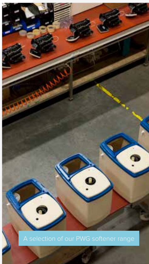
A selection of our PWG softener range