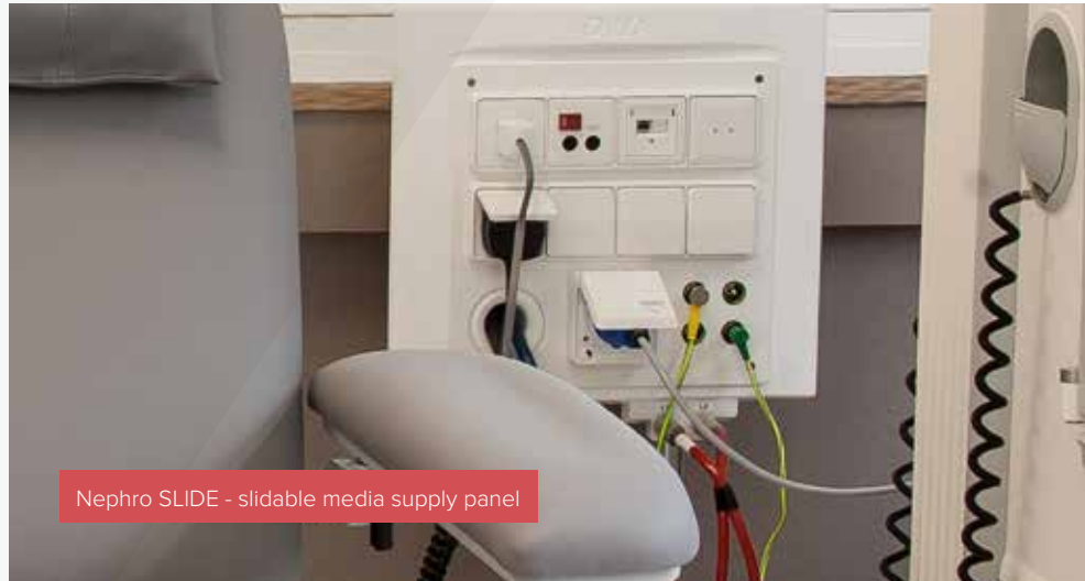
Nephro SLIDE - slidable media supply panel