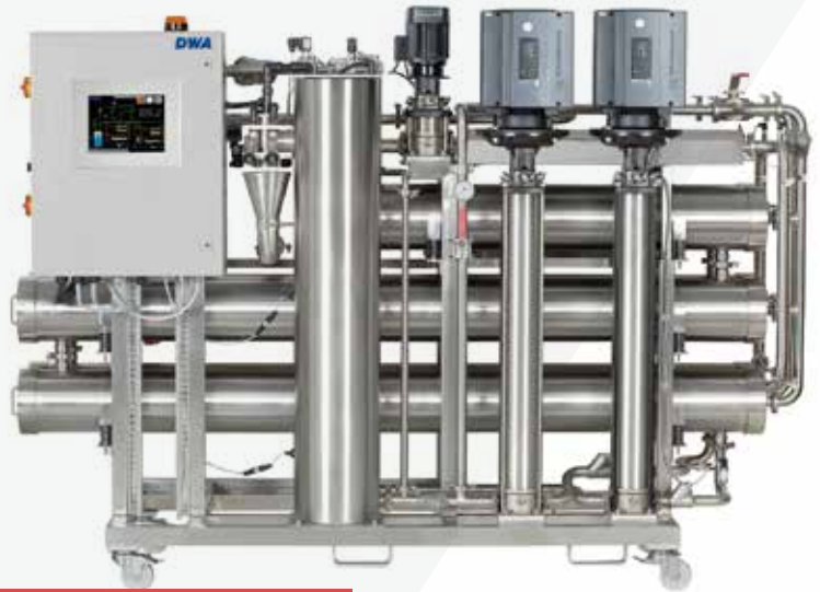
NephRO TP - Twin-pass reverse osmosis