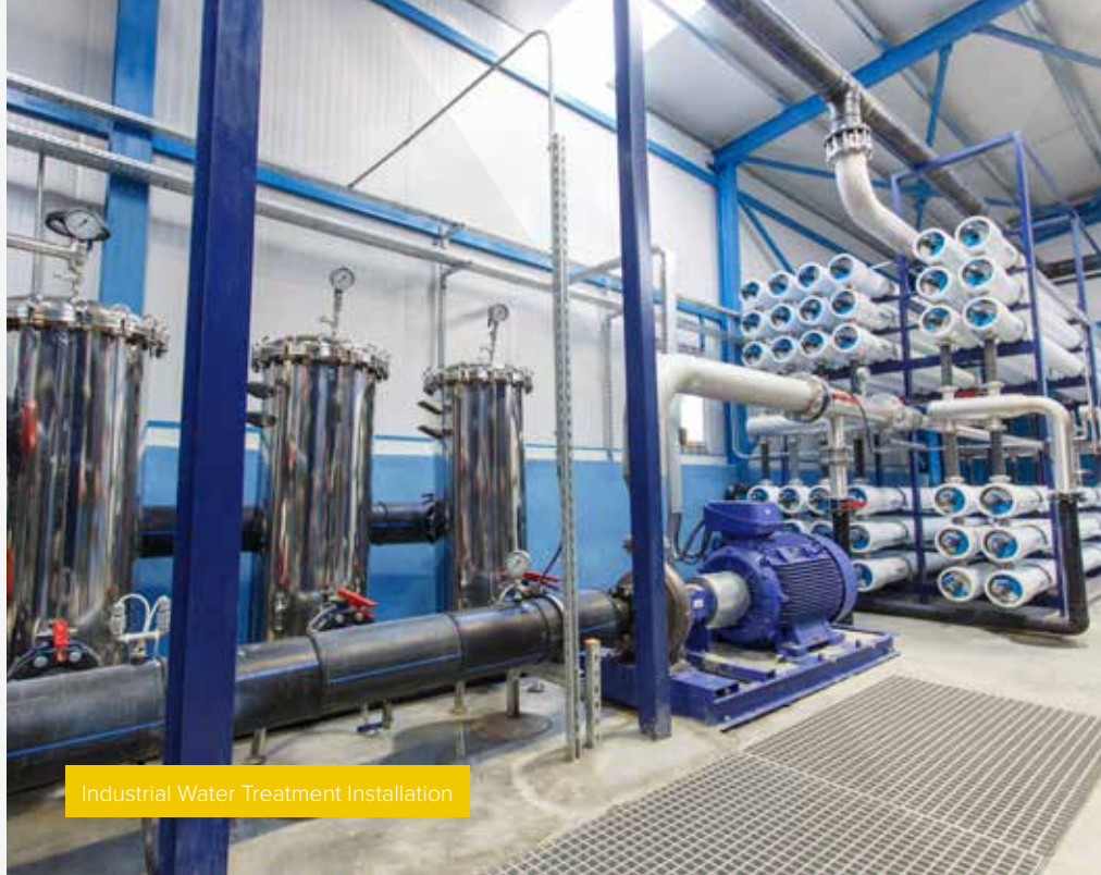
Industrial Water Treatment Installation