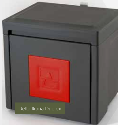
Delta Ikaria Duplex