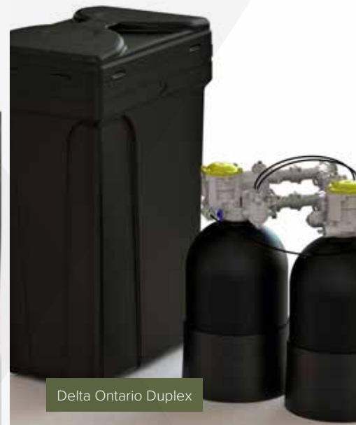
Delta Ontario Duplex