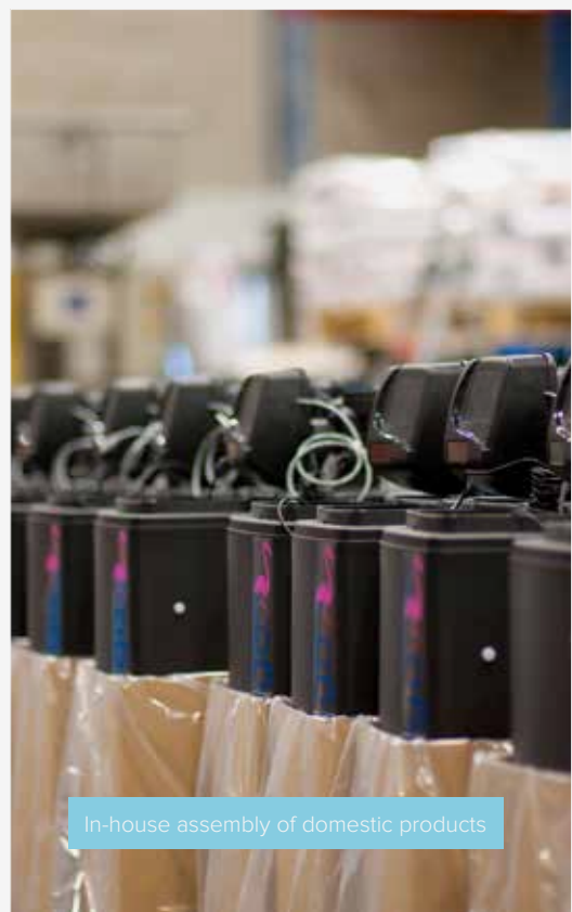
In-house assembly of domestic products