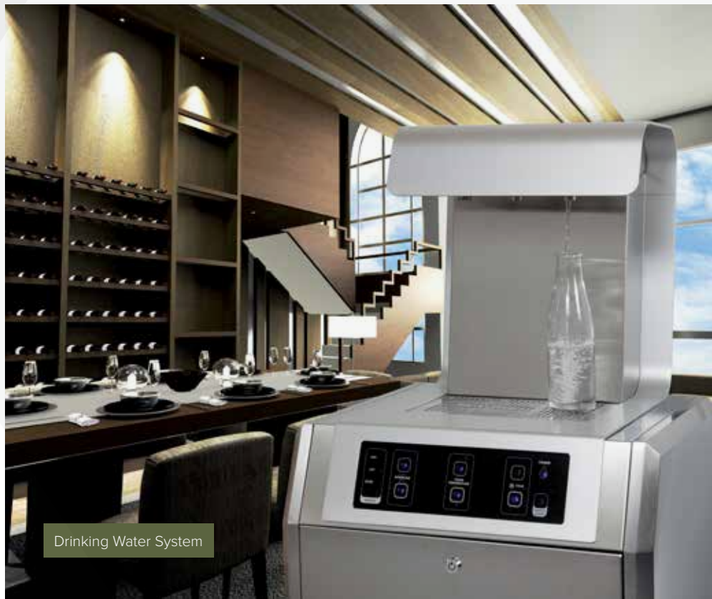
Drinking Water System