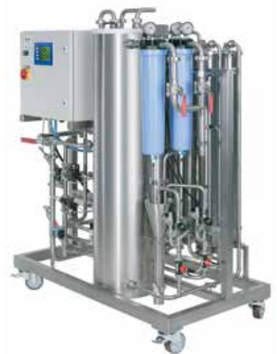
Modula S-XL - Reverse Osmosis System for high permeate flows and operational safety