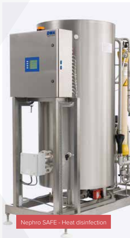
Nephro SAFE - Heat disinfection