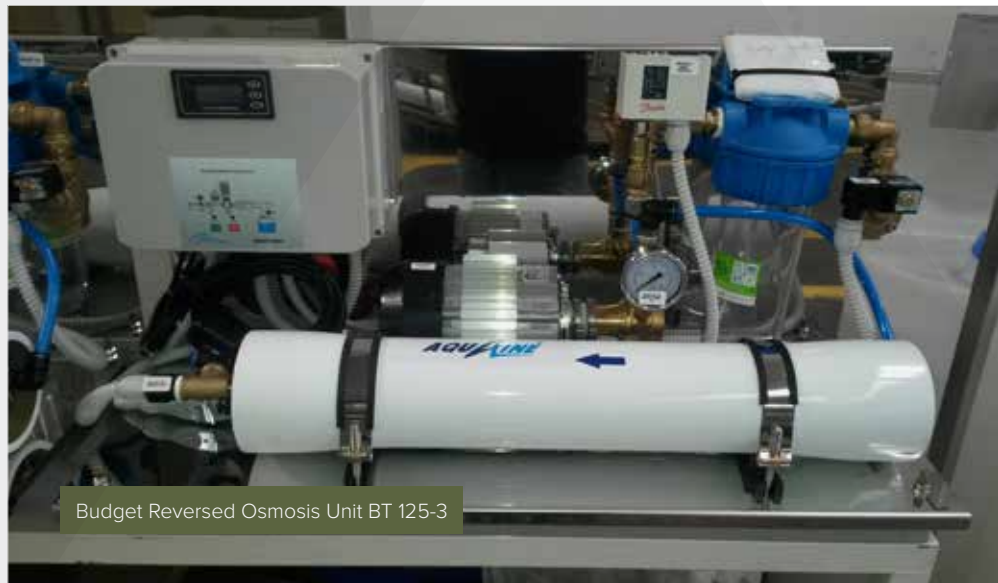
Budget Reversed Osmosis Unit BT 125-3