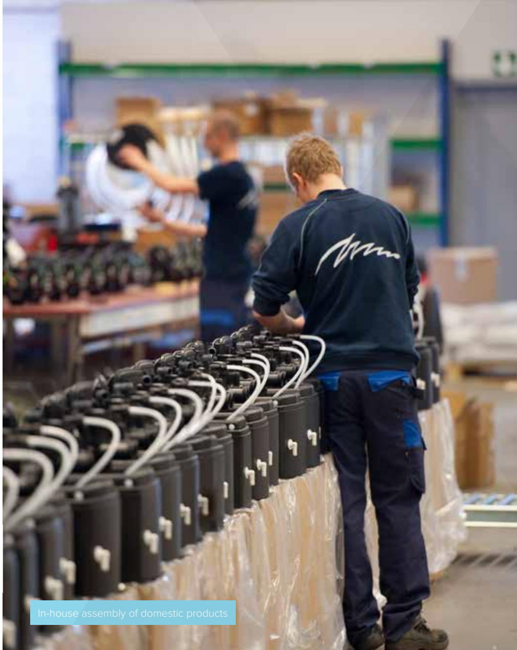
In-house assembly of domestic products